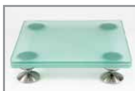
Floor plate arm