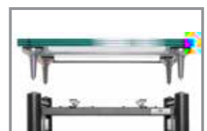
Turntable plate arm

Any special & custom version upon request